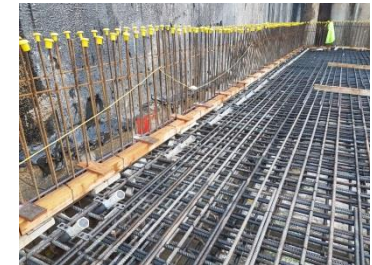
Construction of basement slab