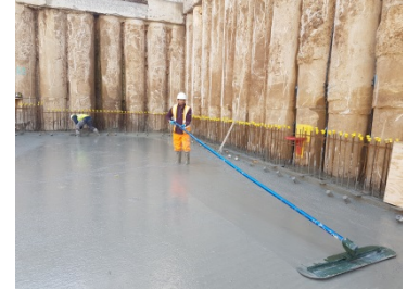
Casting of Basement Slab

If you become aware of an urgent operational issue concerning the construction, please contact Willmott Dixon immediately on 07704 260779 (weekdays) or 08457 335533 out of hours. For any other enquiries concerning the project, please contact rf.pearsinfo@nhs.net .